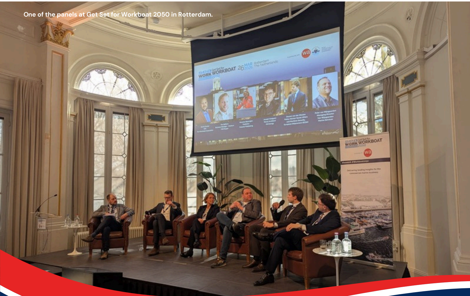
One of the panels at Get Set for Workboat 2050 in Rotterdam.