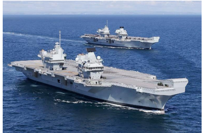
HMS Queen Elizabeth II HMS Prince of Wales