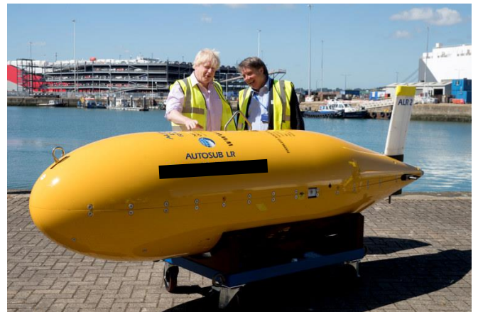
Boaty McBoat Face