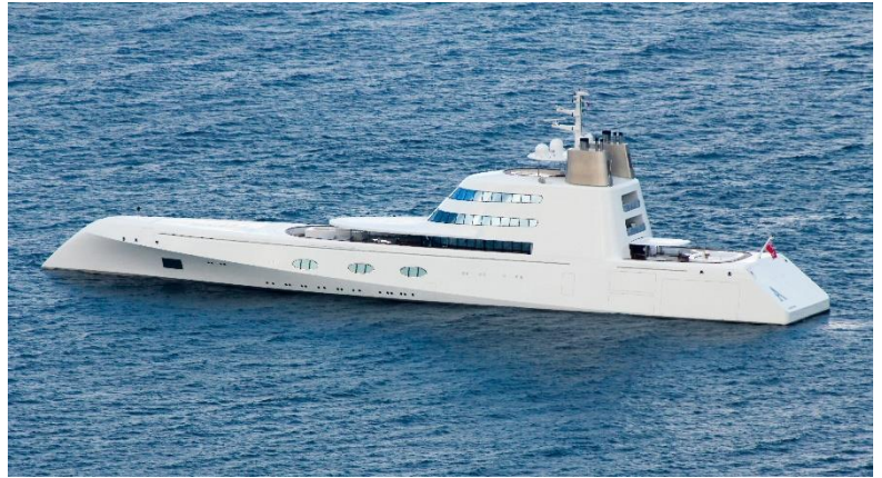
Motor Boat A